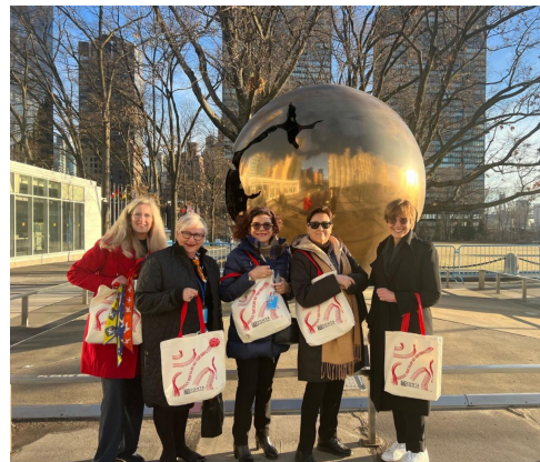
Zontians at CSW69 in New York City proudly display the empowering "Negotiate your salary, not your rights!" tote bags.

UN Secretary-General António Guterres spoke these words during his opening remarks at the 69th session of the Commission on the Status of Women (CSW69) in New York City this past week. He reminded us that the world is facing significant challenges, and gender equality must be at the forefront of our efforts.